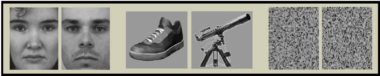
Figure 1. Experimental stimuli: images of faces, objects, and scrambled objects

The FFA is a face selective area in the fusiform gyrus, but its exact location varies from individual to individual. In order to locate the FFA, participants were given n-back block-design tasks. Participants watched series of images of either faces, objects, or scrambled objects flash in quick succession while trying to determine when an image was flashed twice in a row. Each subject participated in three fMRI scanning sessions, with two trials of each of the three image types within each session, for a total of 18 complete trials.